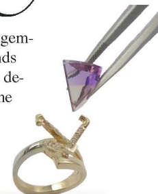
Step Four: The Final Touches

Step Four: After our certified gemologists hand-select the diamonds and gemstones needed for your design, our goldsmiths set each one into the metal. Then they buff and polish the piece to give it a brilliant shine!