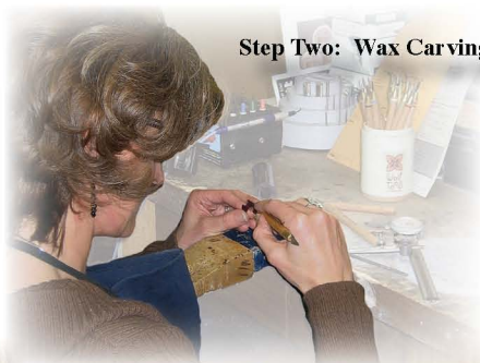
Step Two: Wax Carving

Step Four: After our certified gemologists hand-select the diamonds and gemstones needed for your design, our goldsmiths set each one into the metal. Then they buff and polish the piece to give it a brilliant shine!